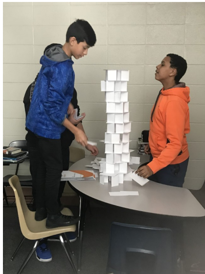
Middle school students participating in an Ignite curriculum activity.